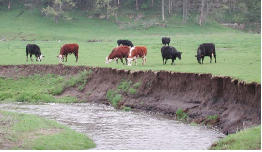
Eroding streambanks contribute to the degradation of Kickapoo Valley streams.