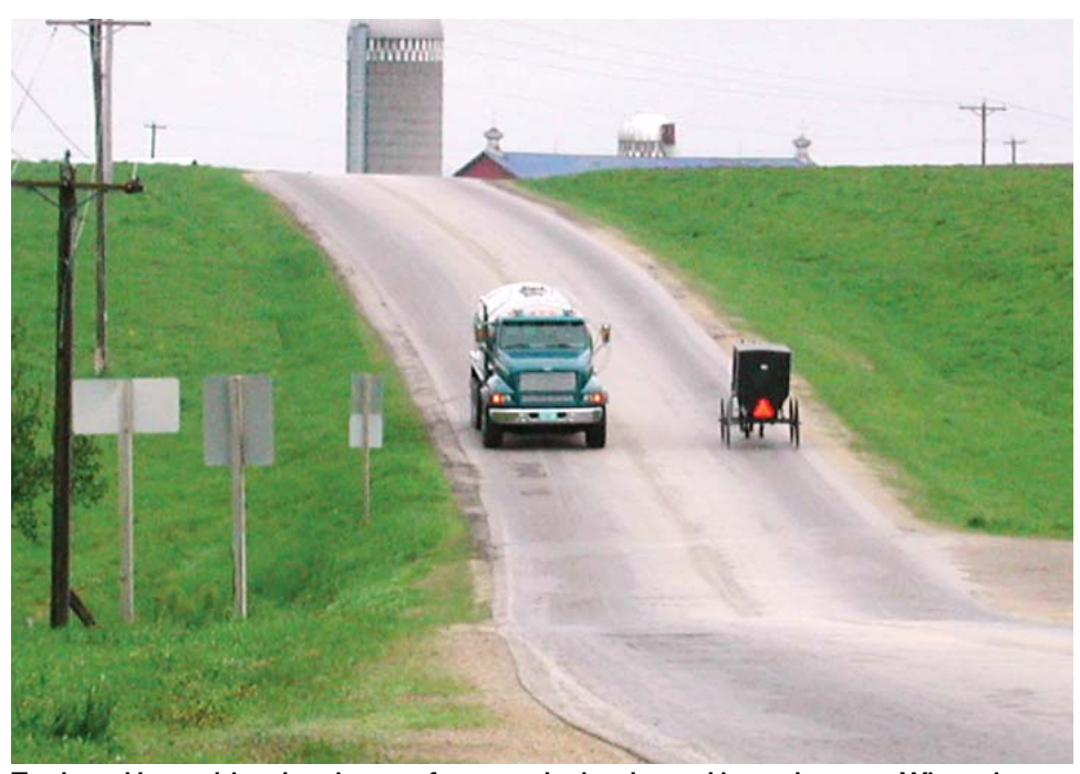
Trucks and horse-driven buggies are often seen sharing the road in southwestern Wisconsin.

Provided 60+ booklets of conservation information to Amish farmers