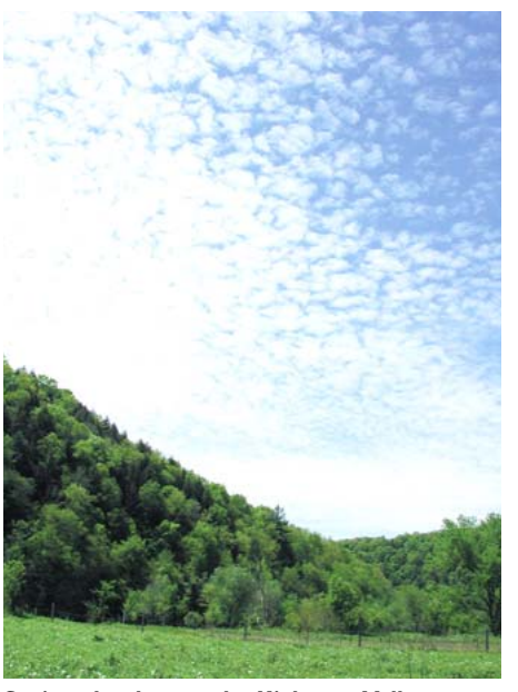
Spring clouds over the Kickapoo Valley.

Peper and other project participants are certain that they are making a break-