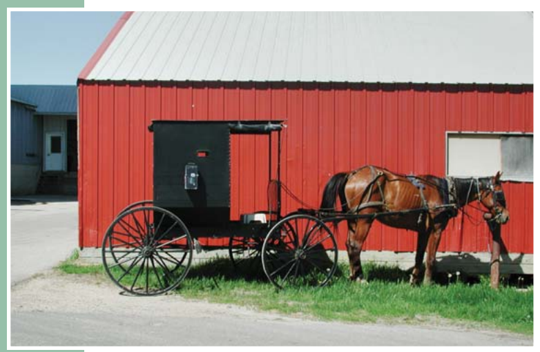
Amish buggy and horse in Cashton, Wisconsin.

practices that have been accepted in the community include buffer strips, woodland grazing, manure handling, composting, free-range chicken rearing, product marketing, stream buffers, rotational grazing, and streambank restoration. These last two have drawn the most attention from the Amish community and have been implemented on several area farms.