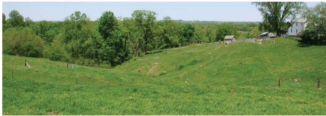
Rotational grazing fence posts lining the hills on an Amish farm.

The most popular hand-out materials have been Pastures for Profit – A Guide to Rotational Grazing, Controlled Grazing for Dairy Cows and Farming Contour Strips . Amish farmers have clearly found the practice of rotational grazing most easily adopted into their lifestyle. Since the beginning of the educational initiative, one training seminar and three pasture walks have introduced interested farmers to conservation practices. With the gradual acceptance of Dan's influence, three other farmers