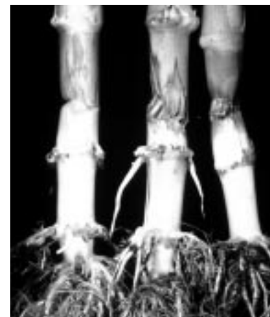
FIG. 3 Twisted and collapsed tissues on the lower internodes of stalks are characteristics of the rare Pythium stalk rot.

Pythium Stalk Rot. Pythium stalk rot is a rare disease usually confined to bottom lands or lower portions of a field. Infection occurs only under extended, hot, humid conditions. It is a rapidly developing stalk rot generally confined to a single internode close to the soil line.