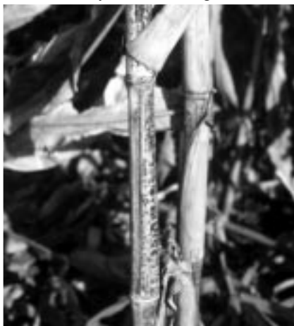
FIG. 2 The dark brown to black, blotchy areas in the stalk rind are characteristic of anthracnose stalk rot late in the season.

The stalk rot phase is the most important. Stalk infections may occur at various stages of growth depending on susceptibility of the inbreds or hybrids. Most hybrids are not affected until after tassling and usually not until shortly before normal senescence. The top kill phase of anthracnose may occur at any point above the ear from 4 to 6 weeks after pollination, while the lower portions of the stalk remain green. The top kill phase is easily confused with corn borer injury, but is differentiated from corn borer injury by the fact that there are no insect entrance holes in the stalk. The stalk rot phase of anthracnose generally first appears as narrow, vertical to oval, water-soaked lesions in the rind tissue. With age, these lesions enlarge and become tan to reddish brown, finally turning dark brown to black late in the season (Fig. 2). The black, blotchy areas on the stalk rind may extend through the rind