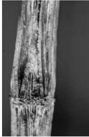
FIG. 6 Disintegrated pith tissue of Fusarium stalk rot may easily be confused with other stalk rots and is not diagnostic for a specific stalk rot.

Fusarium stalk rot is more severe where stress factors occur during the growing season, as with Gibberella stalk rot. The causal fungus, Fusarium moniliforme , survives in crop residues (stalks, ears, ear shanks, cobs) or in the soil. Infection occurs directly through wounds caused by hail or insects, but more importantly, through the roots, mesocotyl, or crown tissues during the growing season.