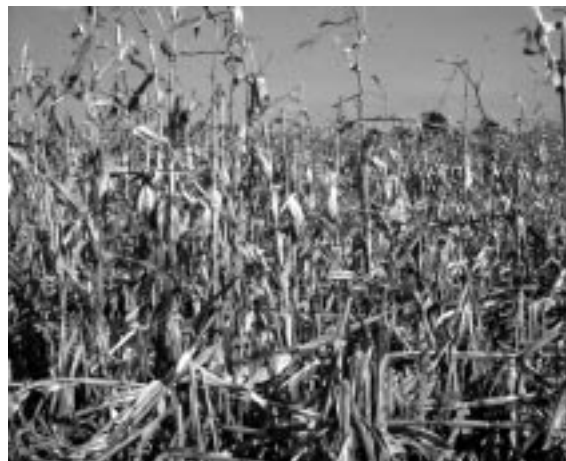
FIG. 1 Severe lodging from stalk rots.

For ease of understanding the various stalk rots and their control measures, stalk rots are classified as either soil-borne or air-borne. The soil-borne stalk rots are those in which the pathogen survives in the soil (sometimes for several years) and infection starts in the root system. Infection of roots may occur at any time during the growing season, but frequently occurs early in plant development. With the soil-borne stalk rots, the fungi remain in the roots, totally innocuous, until after grain filling commences. As the carbohydrate levels of the stalk tissues are depleted through grain filling, the natural resistance of the stalk diminishes and the stalk rotting organisms then spread from the root system into the pith tissues. The