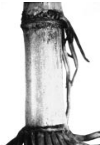
FIG. 4 The tiny black dots (pycnidia) clustered at the nodes and beneath the stalk epidermis suggest Diplodia stalk rot.

growth may also be present on the stalk surface in humid weather. These specks are subepidermal (formed beneath the epidermis) structures called pycnidia. Pycnidia are spore-producing structures of the fungus Diplodia and cannot be scraped from the stalk rind with the thumbnail. This characteristic separates this disease from other stalk rot organisms.